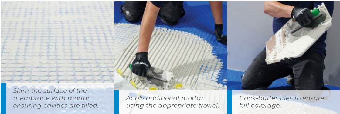
Skim the surface of the membrane with mortar, ensuring cavities are filled.